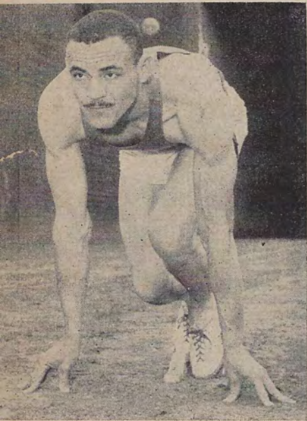
MAL WHITFIELD, 440 and 880