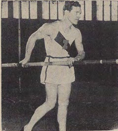
BOB RICHARDS, pole vault