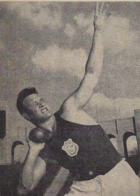
PARRY O'BRIEN, shot put