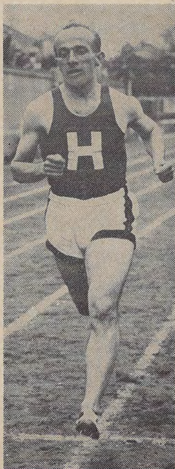
LUXEMBOURG'S JOSY BARTHEL OLYMPIC 1500 METER CHAMPION